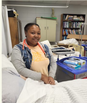
DARIA WELLS HEALTH SCIENCE